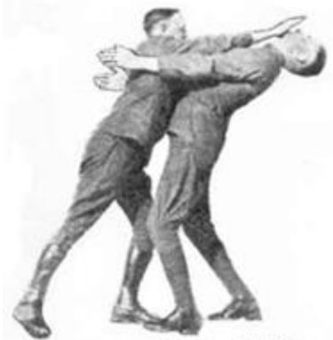
"TWO" — FIG. 29