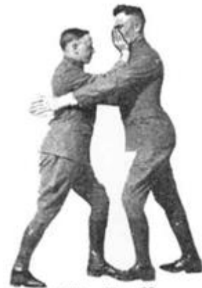
"ONE" — FIG. 28

If you hold your elbow away out as shown in fig. 30 you are using only your arm and shoulder muscles against the strength of his neck.