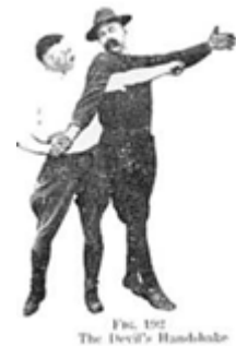
FIG. 192 The Devil's Handshake

This is not a very reliable method of taking prisoners and is simply given to increase your general experience in such matters.