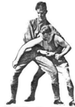
"FOUR" — FIG. 94

Practice this trick three times each alternately.