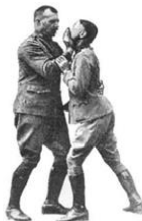
"ONE" — FIG. 38

Jujitsu tricks are done with great rapidity on an opponent who is usually moving just as quickly. You utilize the momentum of the opponent to unbalance and defeat him instead of relying on your own strength and weight. If you try to master the two complicated problems of your opponent's BALANCE and MOMENTUM and at the same time make your legs and arms perform a complicated, unfamiliar feat, you are up against an intricate task in